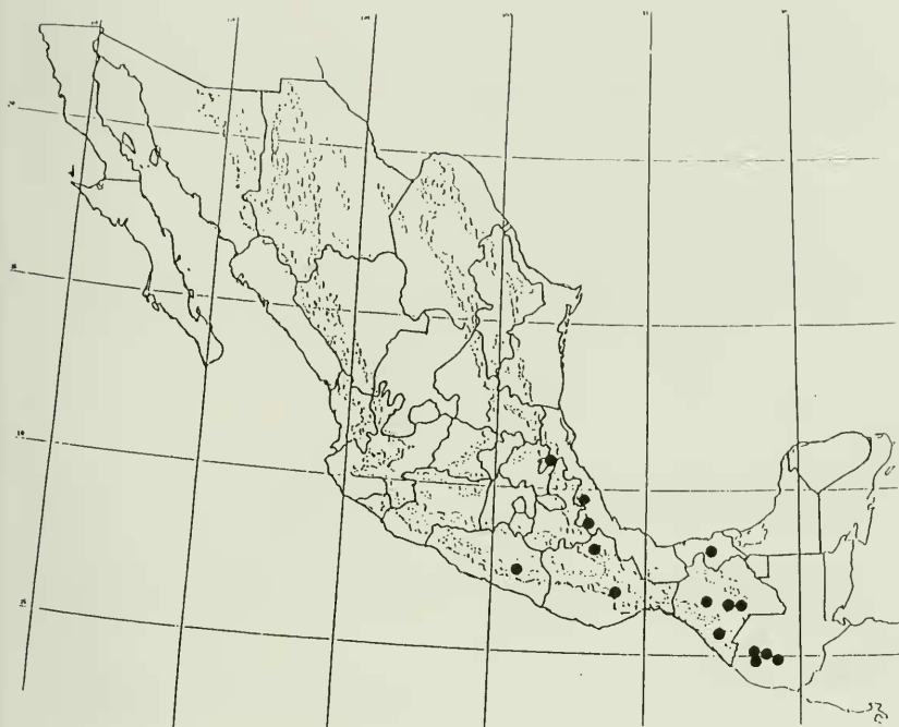
Figure 2. Distribution of Stachys lindenbergii .